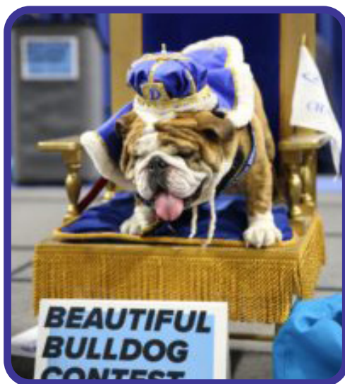
Beau, 2019 Most Beautiful Bulldog